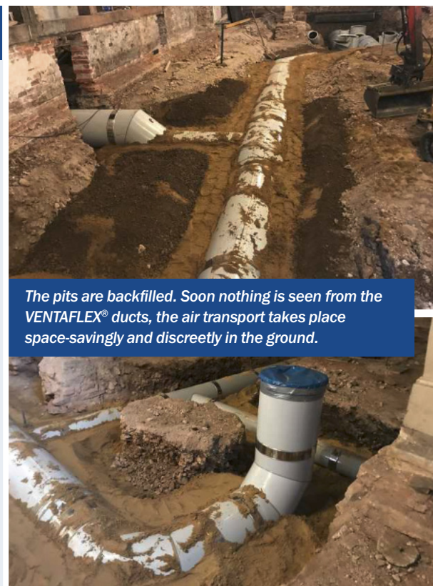
The pits are backfilled. Soon nothing is seen from the VENTAFLEX® ducts, the air transport takes place space-savingly and discreetly in the ground.