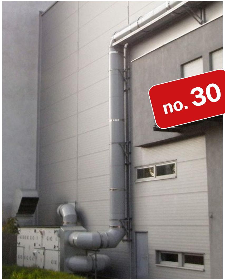
Air ducts leading from a HVAC system constructed in an exterior area into an existing climbing gym